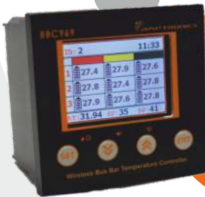
BBC969 With Display