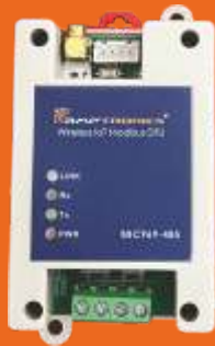
BBC969-485 Without Display